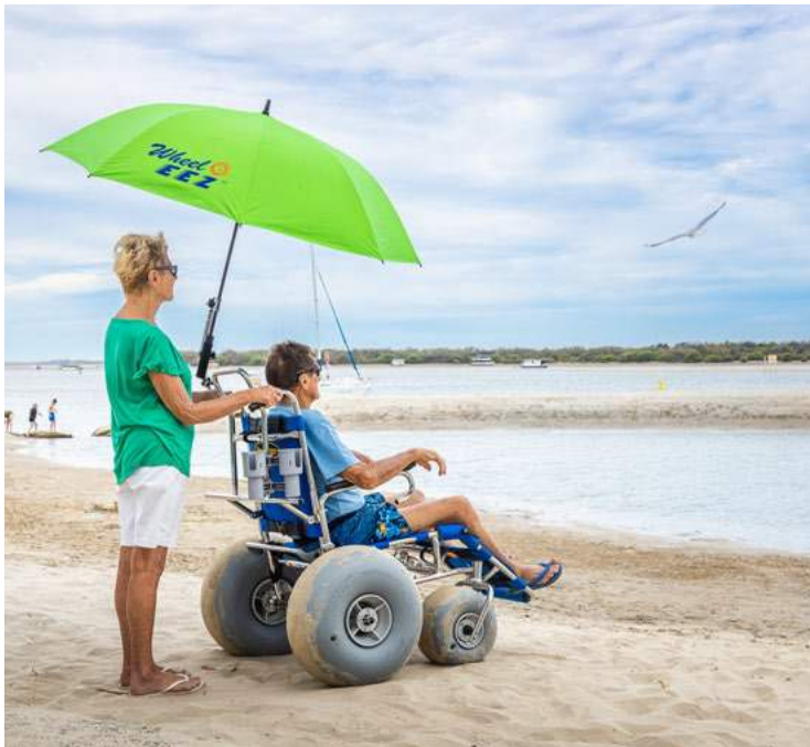
SANDCRUISER® ALL-TERRAIN CHAIR