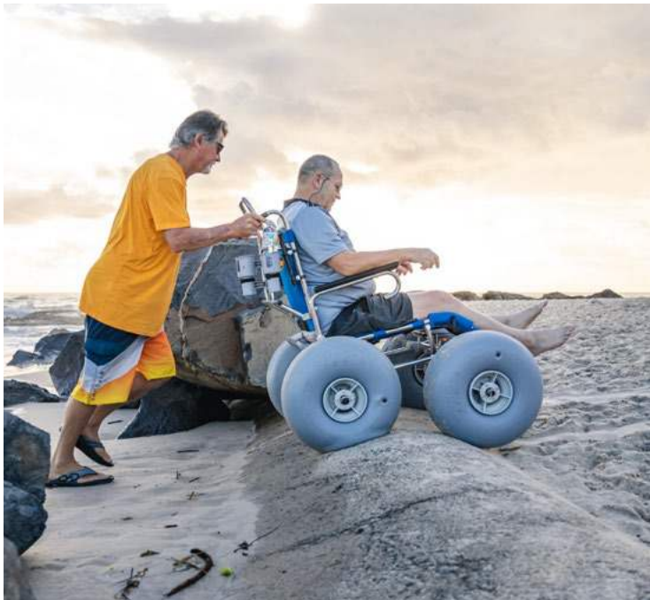
SANDCRUISER® DUNE BUSTER